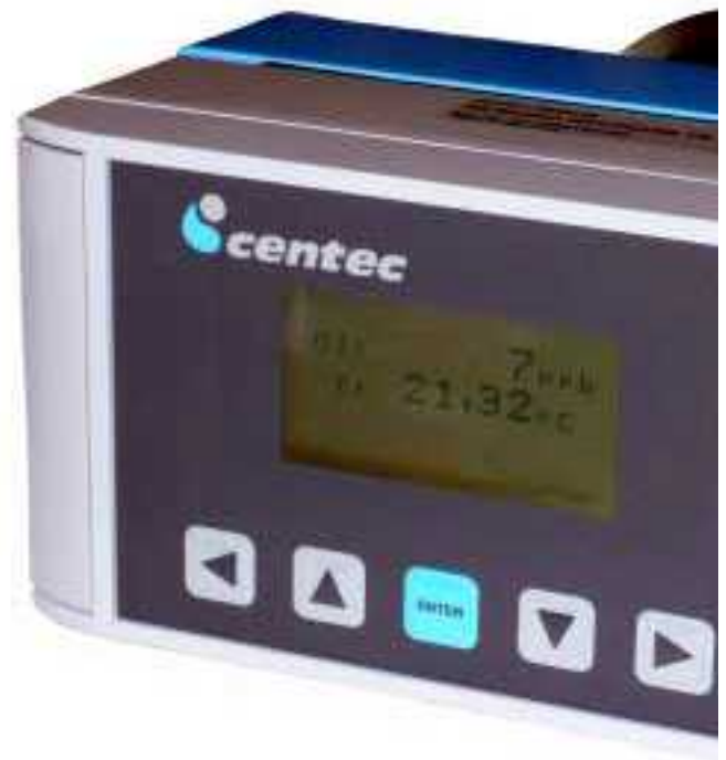
Centec OXYTRANS-TR Optical Inline Oxygen Measurement